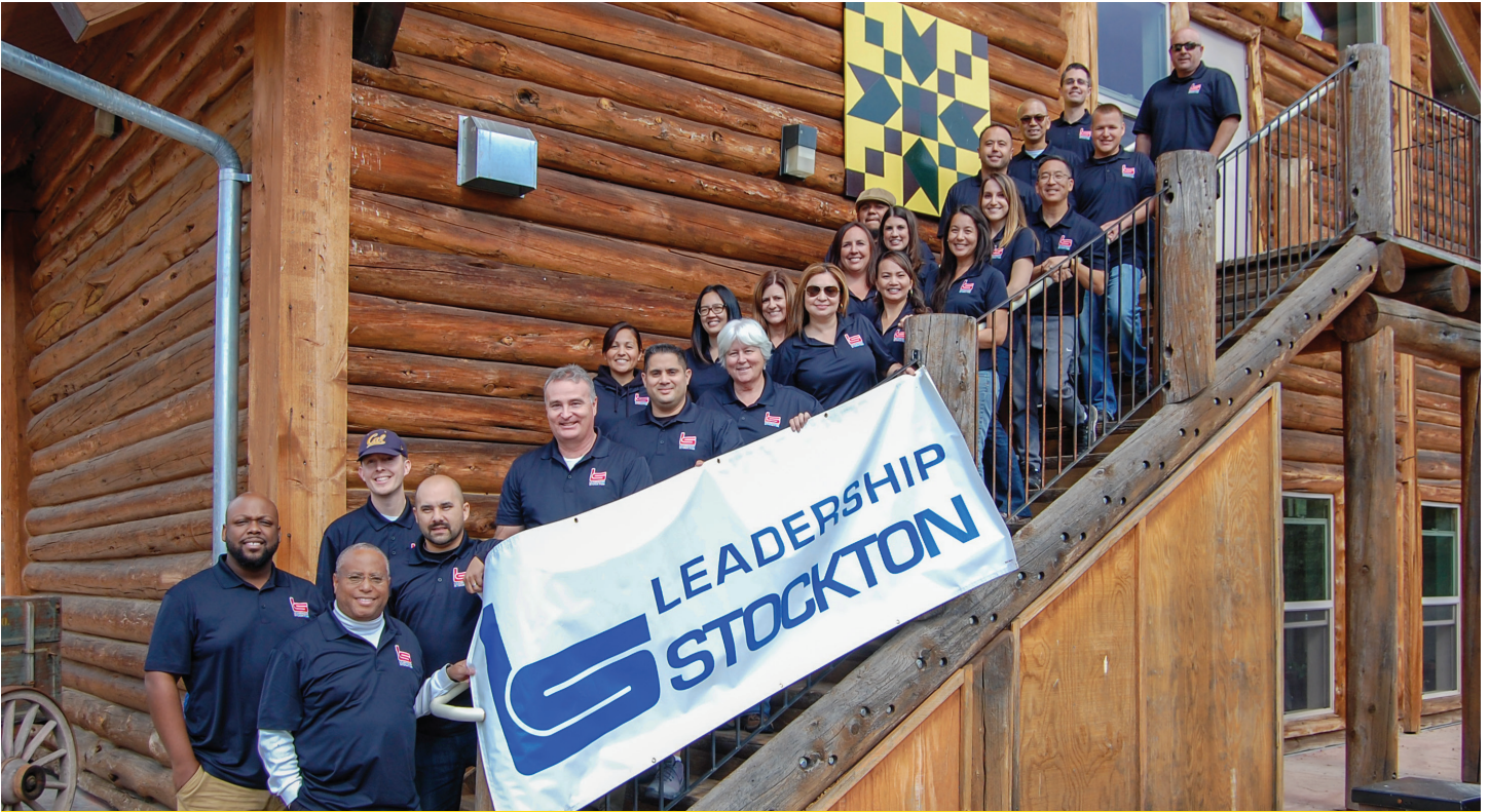
Leadership Stockton Class of 2017/2018 at their Retreat in September 2017